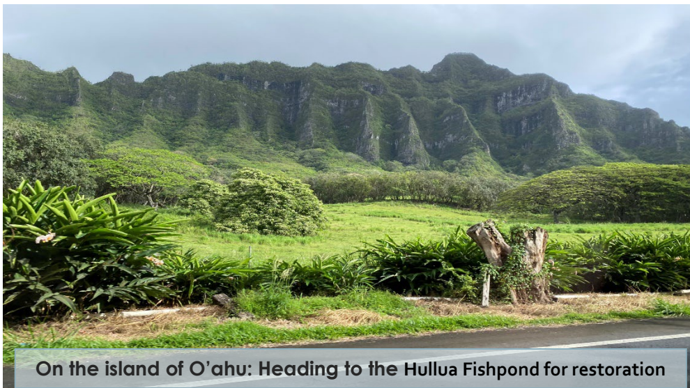
On the island of O'ahu: Heading to the Hullua Fishpond for restoration